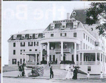
OLDIE BUT GOODIE: Clockwise from top: the completely rebuilt Ocean House; a guest bedroom with a window into the bathroom; the original structure in 1908; a guest bathroom.