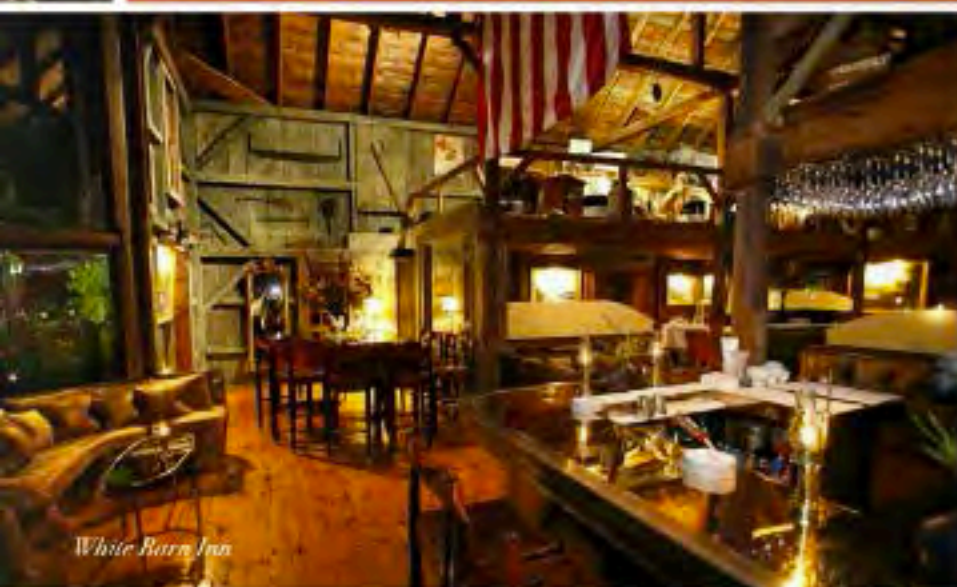
White Barn Inn

While the country heats up for summer, there's no reason to head down south. Just a short drive north of us are some of the most fantastic summer destinations in the country, and we've got your roundup right here.