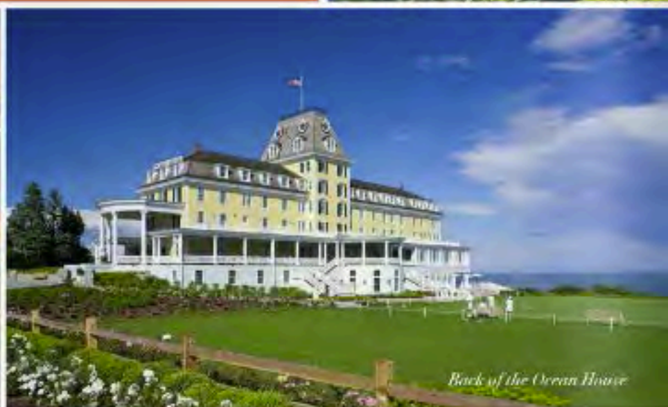
Back of the Ocean House