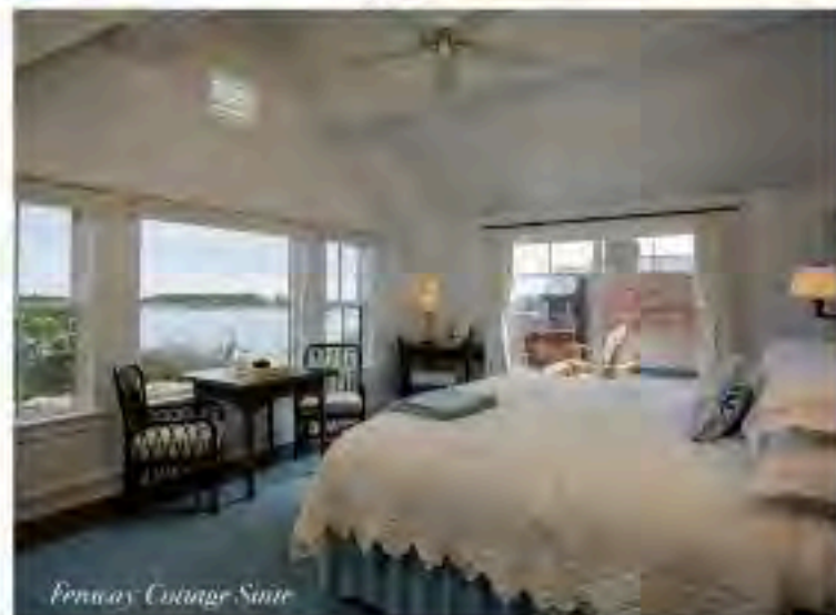
Fenway Cottage Suite