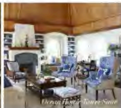
Ocean House Tower Suite