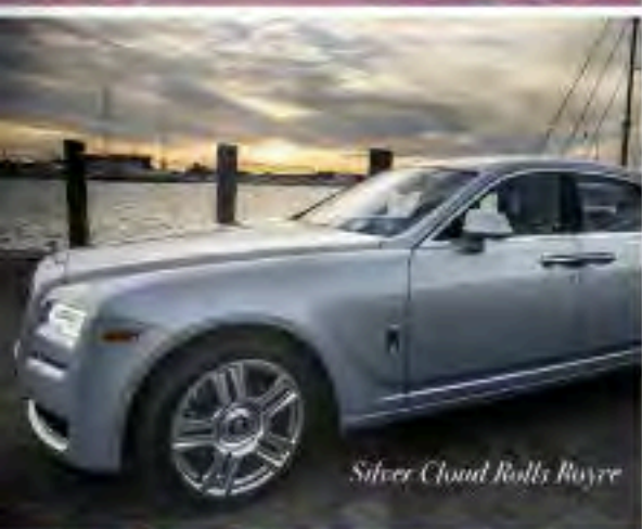
Silver Cloud Rolls Royce