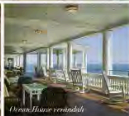
Ocean House veranda