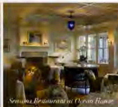
Seasons Restaurant at Ocean House