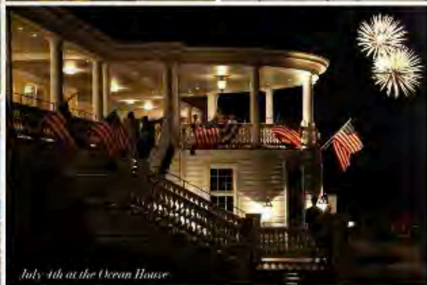
July 4th at the Ocean House

the ocean from there as well. Wind your way through a private garden path to a locked gate, which opens into each villa's private courtyard. Walk a narrow path up towards your room, and you'll notice a private hot tub perfectly suited for New England's crisp summer evenings.