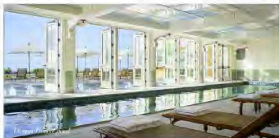
Ocean House pool

As a member of Relais & Chateaux, every aspect of your trip to Ocean House promises to be first class through and through. Throughout the year guests can enjoy movie nights, where a projection