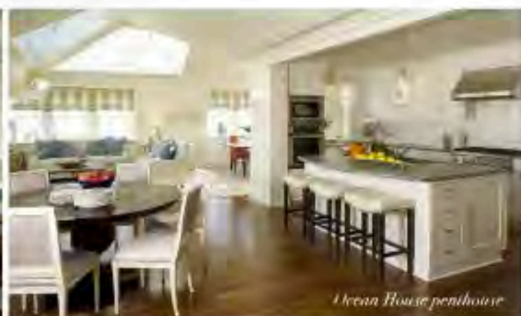
Ocean House penthouse