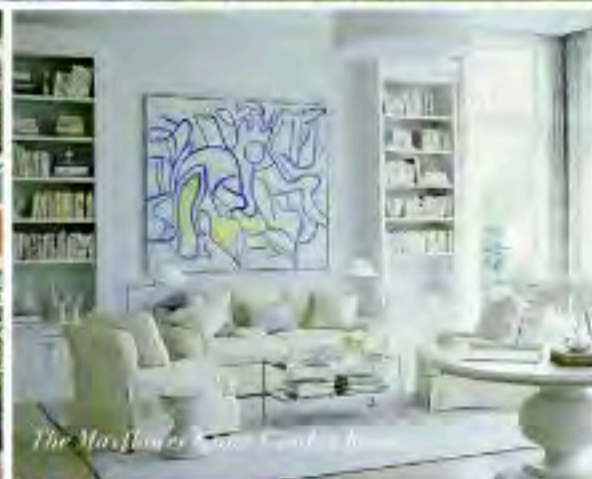
The Mayflower Grace Guest Room