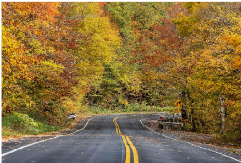
Autumn scenic byway in Vermont

I travel the world: smart, luxe -- and often.