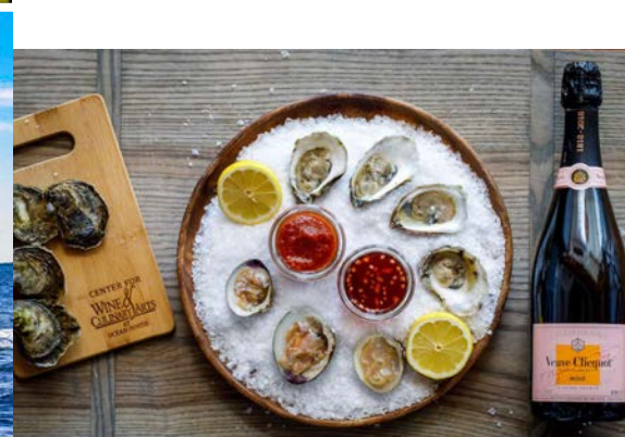
Enjoy Cooking and Wine Classes in the Center for Wine & Culinary Arts