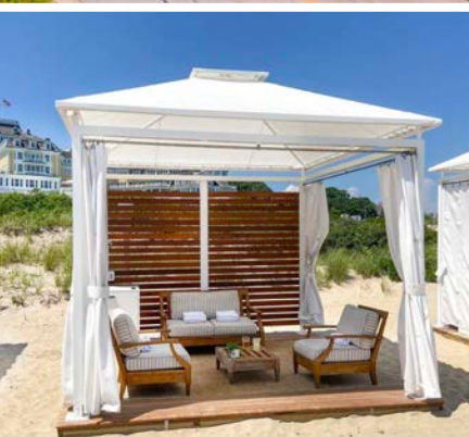
Book a Private Cabana, with Beach Butler Service