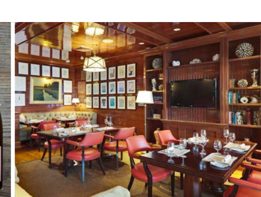
Dine in the Member's Only Club Room, or other Signature Ocean House Restaurants