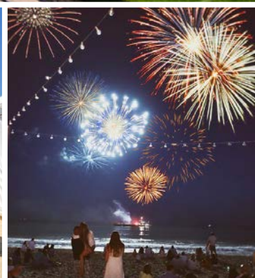
Join Special Events, Such as the Independence Day Beach Ball