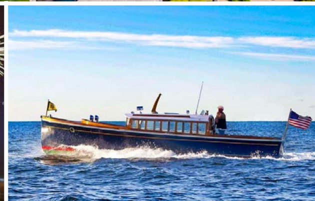
Tour the Rhode Island and Connecticut Coast on the Dandy Motor Yacht, or Book a Day-Long Fishing Excursion